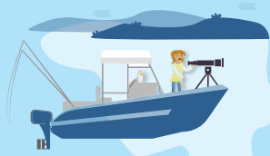
On a boat